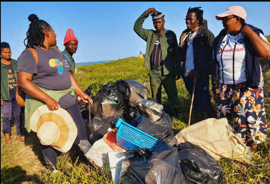
ECPTA staff and community members ensuring the cleanliness of Mkhambathi Nature Reserve.

Through initiatives like the environmental awareness campaign, the ECPTA and Mkhambathi Nature Reserve are striving to create a more sustainable future. By empowering individuals and communities to embrace responsible practices and protect our precious ecosystems, we can collectively work towards a healthier planet for generations to come.