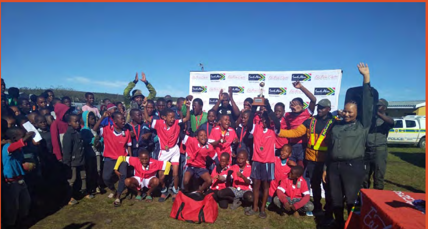
Winners of the anti-poaching soccer tournament flanked by ECPTA staff and SAPS members.

In a bold effort to raise awareness about wildlife conservation and combat poaching, the Eastern Cape Parks and Tourism Agency (ECPTA) has taken an innovative approach that harnesses the power of sports and community engagement. The Thomas Baines Nature Reserve, located in the Eastern Cape, recently hosted a thrilling soccer tournament in early June. The tournament aimed to educate young people from communities adjacent to ECPTA-managed reserves about the critical issue of poaching and its detrimental impact on society.